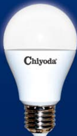
LED BULB CLASSIC 7W, 9W, 11W