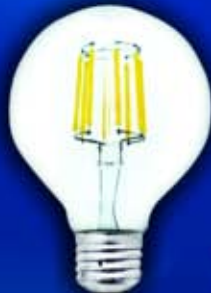
G-80 6W, 8W