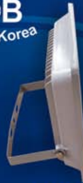
LED FLOODLIGHT DOB SLIM 30W, 50W, 100W