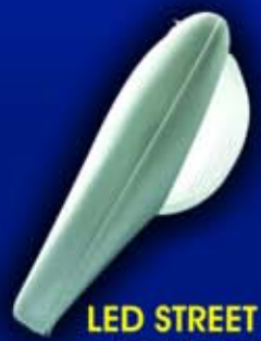
LED STREET LIGHTING 50W, 100W