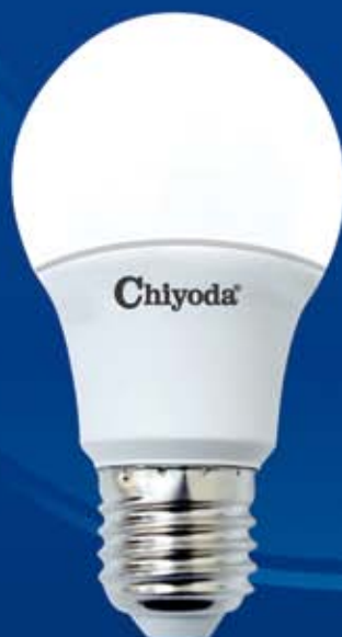
LED BULB R&B ( LED MERAH BIRU ) A60 5W, 7W, 9W, 11W, 13W A80 15W