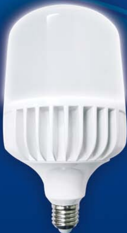
LED BULB T 120 28W, 40W