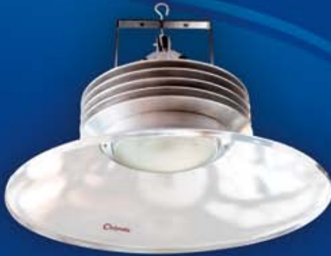
LED GARDEN SERIES 50W, 85W