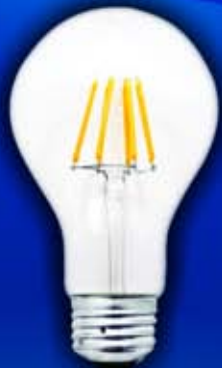
PS-75 6W, 8W