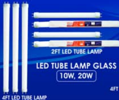
LED TUBE LAMP GLASS 10W, 20W