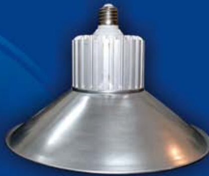
LED LAMPU HALAMAN 50W, 100W