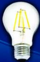
A-60 2W, 4W, 6W, 8W