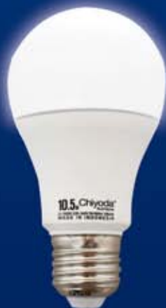
LED BULB PLATINUM 4.5W, 6.5W, 8.5W, 10.5W