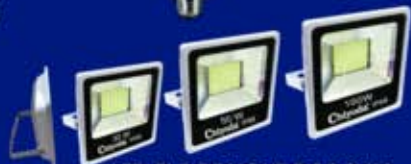
LED FLOODLIGHT DOB SLIM 20W, 30W, 50W, 100W