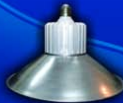
LED LAMPU HALAMAN 50W, 100W