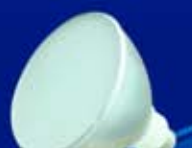
LED PAR 30, PAR 38 11W, 15W