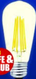
ST 64 4W, 7W