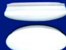
LED CEILING ROUND 12W, 18W, 24W, 36W