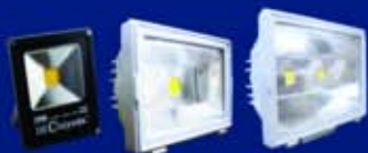
LED FLOODLIGHT COB 50W, 100W, 150W