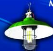
LED LAMP 12W, 16W, 20W