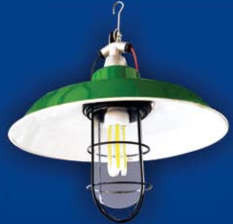
LED GARDEN LAMP 12W, 16W, 20W