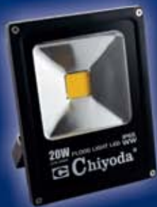
LED FLOODLIGHT COB 20W, 50W, 100W